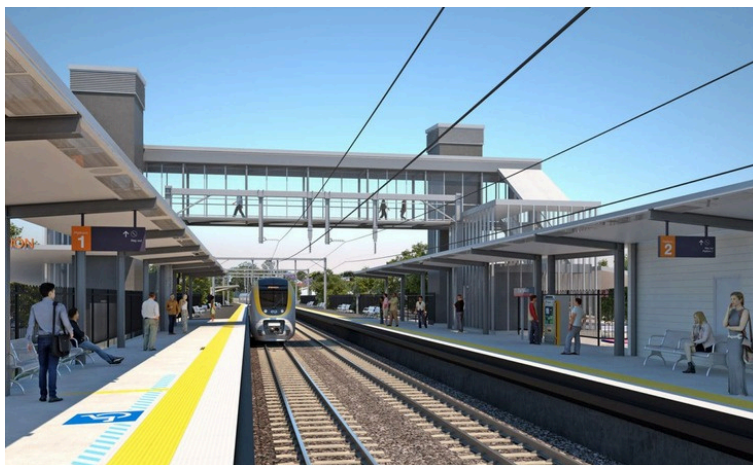
*East Ipswich train station which is fully accessible

East Ipswich boasts excellent connectivity, with major roads such as Brisbane Road and the Ipswich Motorway providing easy access to the Ipswich central business district and other nearby suburbs. In addition to its healthcare proximity, the suburb also hosts several local medical centres and pharmacies for day-to-day health needs. The area's mix of older Queenslander-style homes and modern developments gives East Ipswich a welcoming atmosphere, attracting a diverse range of residents including families, young professionals, and retirees. This blend of accessibility, community, and essential services makes East Ipswich an ideal location for Specialist Disability Accommodation, ensuring that residents can enjoy both convenience and a sense of belonging.